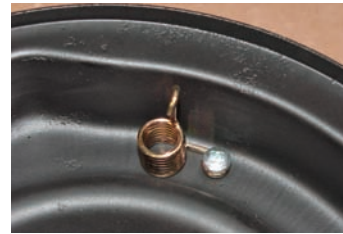
Photo #9: The new spring is held to the bucket with a #8 sheet metal screw, also supplied.

Photo #5: With everything removed, clean the bucket and paint it chassis/semi gloss black P/N 49-344.