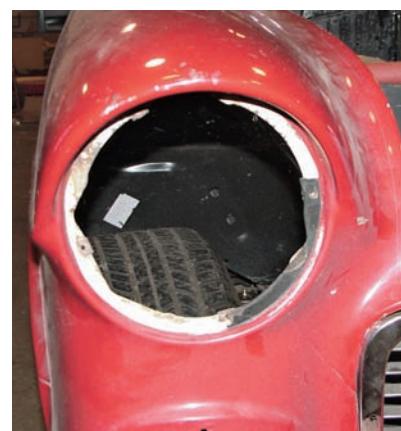
Photo #12: A flat rubber seal fits between the headlight bucket and the front fender. When you removed the bucket from the fender, the seal was probably not there or was dried up and broken. We will replace these seals.

Photo #8a, 8b & 8c: The new adjuster brackets are attached to the bucket with two #10-32 X 3/4" machine screws, serrated washers and nuts supplied with the kit.