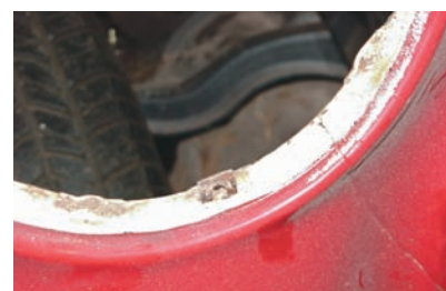
Photo #13: There are four J-nuts at the front opening of the fender for the headlight bucket retaining screws. These new nuts are supplied with the hardware kit.

Photo #12: A flat rubber seal fits between the headlight bucket and the front fender. When you removed the bucket from the fender, the seal was probably not there or was dried up and broken. We will replace these seals.