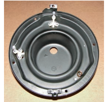
Photo #10: The refurbished bucket is now ready to go back in the car. It's always fun to take a damaged original part and with a little time and money bring it back to something that will last another 50 years!

Photo #9: The new spring is held to the bucket with a #8 sheet metal screw, also supplied.