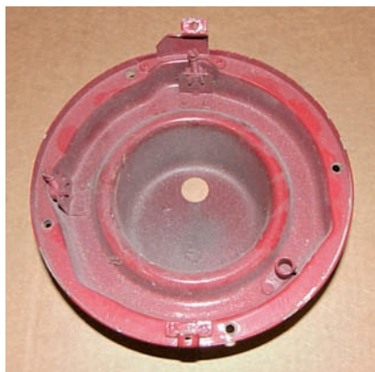
Photo #1: The bucket has two adjuster screws and a coil spring that attaches to the sub bucket both to hold it in place and for adjustment. Many times the nylon blocks on the adjusters strip out or break off and the hook on the spring will break.