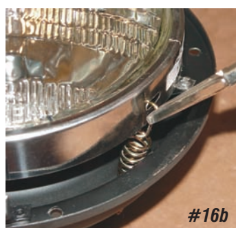
Photo #16a & 16b: The trim ring for the headlight is held to the sub bucket with three small sheet metal screws. Key the headlight and sub bucket assembly into the new adjuster screws and snap the spring into the hole in the ring using needle nose pliers.

With the new adjusters it will be a breeze to properly adjust the headlights.