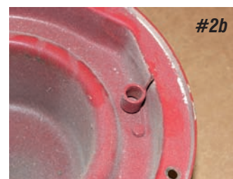
Photo #2a & 2b: The adjuster blocks are held to the bucket with a bracket that is riveted in place, while the spring is riveted directly to the bucket.