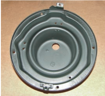
Photo #5: With everything removed, clean the bucket and paint it chassis/semi gloss black P/N 49-344.