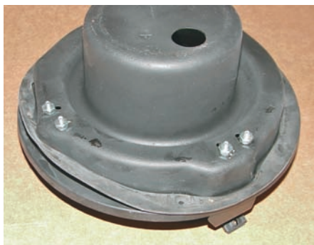
Photo #14: The headlight bucket seals P/N 05-15 for 1955-56 and P/N 05-53 for 1957 will match the contour of the bucket and fit between the bucket and fender.