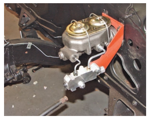
Photo #7: With the lines still loose, push on the proportioning valve flexing the brake lines until the holes in the valve line up with the holes in the mounting bracket and there