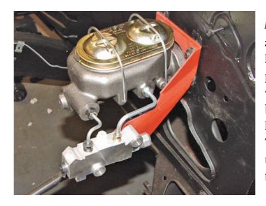
Photo #5: Next, attach the brake lines to the proportioning valve inlet ports leaving the nuts loose at this time. The lines will hold the valve in place for now.

piece of cake to make them fit. When working with short, small brake lines it gets pretty tough to make them look professional if you try bending them yourself. The pre-bent lines in our kits are a nice addition. Attach the lines to the master cylinder first, leaving the nuts loose at this time.