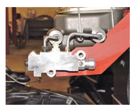
Photo #6: Due to the variations in master cylinders, firewalls and proportioning valve brackets, once the two lines are installed, the holes in the valve may not line up exactly with the holes in the valve mounting bracket.