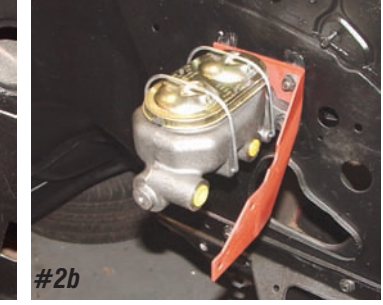
Photo #2a & 2b: When installing a non-power brake master cylinder, the upper two studs on the firewall are used to hold the GM style proportioning valve bracket. The lower two studs are used to hold the brake master cylinder in place.

Photo #3: A nonpower brake master cylinder for drum or disc brakes will have a deep hole in the rear of the piston for the brake