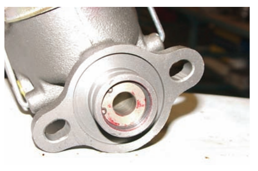
Photo #3: A nonpower brake master cylinder for drum or disc brakes will have a deep hole in the rear of the piston for the brake

pedal push rod. A power brake master cylinder will have a shallow dimple in the piston for the brake booster push rod.