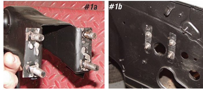
Photo #1a & 1b: The original master cylinder is held to the firewall with four 3/8" studs and nuts. The studs are mounted to the front of the brake pedal swing arm assembly and protrude through the four holes in the firewall.