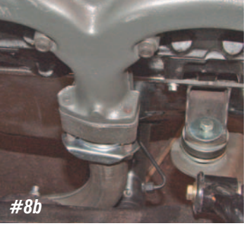
Photo #8a & 8b: The flat gasket included with the exhaust system seals the heat riser or heat riser delete to the exhaust manifold. With the heat riser or heat riser delete in place, install the passenger side exhaust pipe leaving the three nuts loose at this time.