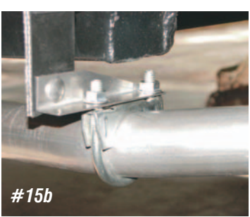
Photo #15a & 15b: The tailpipe hanger has a rubber strap with a steel tab to fit under the muffler clamp. Mount the hanger to the rear of the bracket and using the supplied muffler clamp, bolt the tailpipe in place. The tailpipes on the performance systems run between the rear end and the shocks while stock systems run between the shocks and the frame.