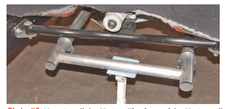
Photo #9: Next, install the H-pipe. The front of the H-pipe will slip up over the exhaust pipes and is held to the exhaust pipes with a muffler clamps. This fully functional H-pipe improves horsepower by equalizing the exhaust pulses as close to the engine as possible.