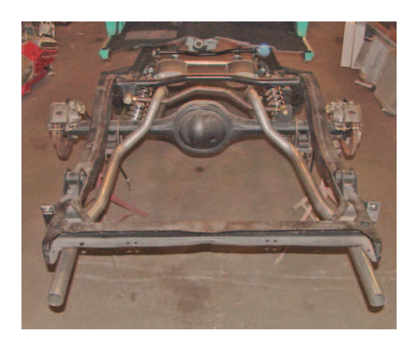
Photo #16: The tailpipes exit straight out the back of the car under the bumper. If you like '57-style corner exit tailpipes, those are available with the turbo and Flowmaster systems as well. The tailpipes a redesigned to work with the CCI rear shock bars and the new CCI coil-over shock conversion. With everything in place and adjusted to your liking, the muffler clamps and exhaust manifold studs may now be tightened. The new system will give the car a whole new sound and will improve low-end power and torque as well. Good Luck.