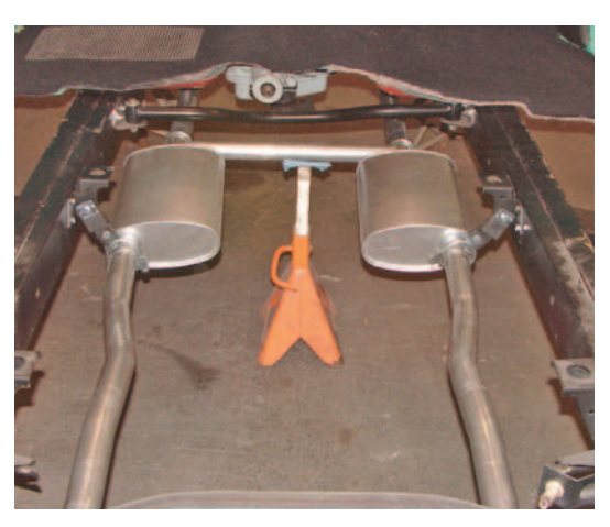
Photo #13: The tailpipes slip into the muffler outlets and are held to the mufflers using the same clamps on the muffler hangers.