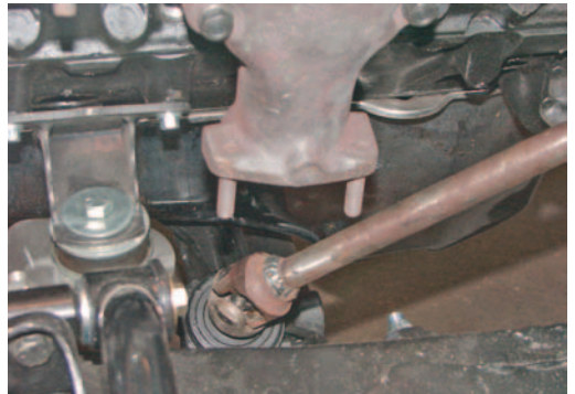
Photo #1: The coupler shaft for the rack and pinion will not allow the use of a center dump rams horn exhaust manifold on the driver's side.