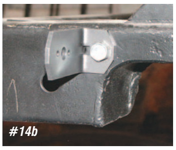
Photo #14a & 14b: The tailpipe hangers are held to the frame using stock dual exhaust tailpipe hanger brackets, also included in the new exhaust system. The brackets are bolted to the frame just behind the rear shackle mounts using one bolt into the frame. There are two holes in the frame; one for the mounting bolt and one for the locating tab on the bracket.