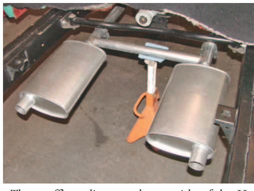
Photo #10: Next, install the mufflers on the H-pipe. The mufflers are held to the H-pipe with the muffler clamps included. The forward inlet of the muffler is centered and the

rear outlet is offset. The mufflers slip over the outside of the H-pipe with the outlets oriented toward the frame.