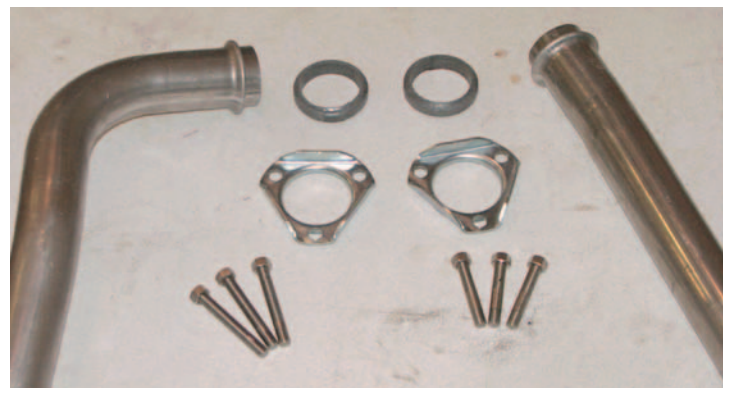
Photo #4: The exhaust system includes two donuts, one gasket for the heat riser and two flanges for the exhaust pipes. We are installing new stainless steel studs and nuts P/N 18-178 in our manifolds.