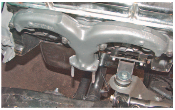
Photo #3: On the passenger side, there is plenty of clearance between the rack and pinion and a standard 2" center dump rams horn manifold. This manifold is readily available, used, from any early 283 or 327 or P/N 24-297.