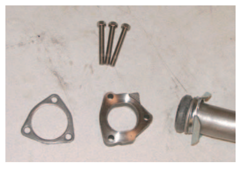
Photo #6: The passenger side exhaust manifold always uses a heat riser. A heat riser P/N 24-01 or heat riser delete P/N 24-03 must be used to properly space the exhaust pipe so it

will line up with the rest of the exhaust system.