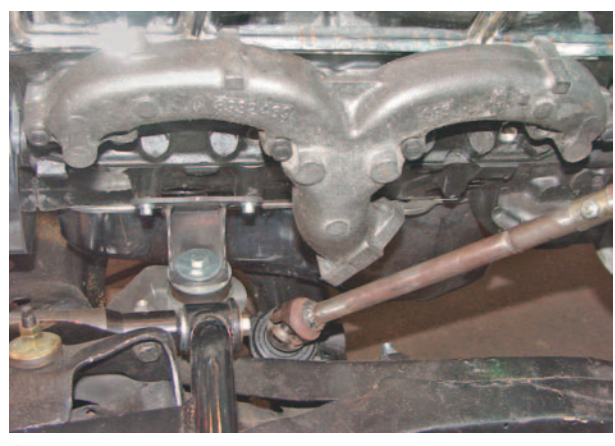
Photo #2: Using the 1969-72 Chevy truck rear dump rams horn manifold P/N 18-414, it will be a breeze to connect an exhaust pipe to the manifold. It looks like GM made this manifold just for our application.

Photo #1: The coupler shaft for the rack and pinion will not allow the use of a center dump rams horn exhaust manifold on the driver's side.