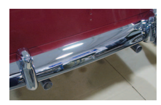
Photo #1: The new tailpipes look nice and clean but are iust lackluster when the rest of the car looks so good.