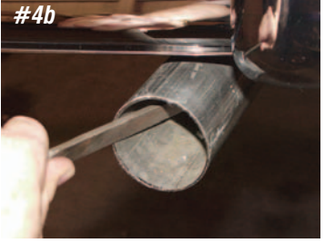
Photo #4a & 4b: The exhaust tips fit into the tailpipes with close tolerances, so if there are any burrs on the inside of the tailpipes remove them with a file.