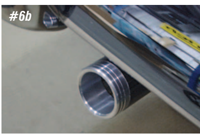
Photo #6a & 6b: With the new billet aluminum tips, our tailpipes look great and the back of the car really looks finished now! This is a 5-minute, super-easy way to really improve the look of the rear of your car.