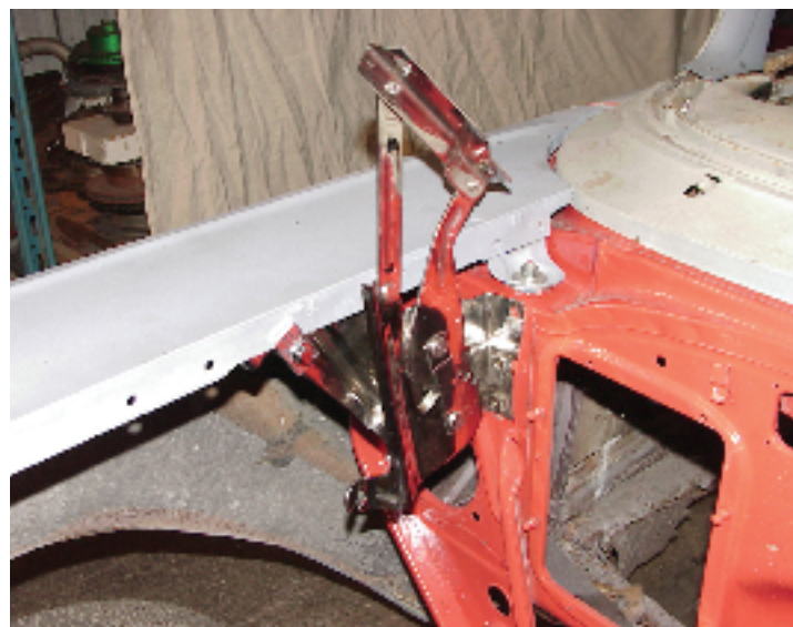
Photo 3: If you want to go that extra step, install the new polished stainless steel hood hinges P/N 54-31. With the new billet brackets and the stainless steel hinges, your '57 will look super custom under the hood! Good luck. ▽

Photos 2a & 2b: The new bracket kit P/N 34-401 includes two polished aluminum billet brackets with ball milled lines and chrome plated mounting hardware. These brackets simply bolt in place of the stock brackets to really dress up the stock hinges.