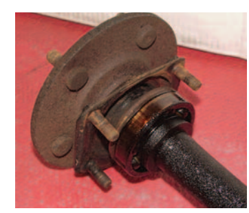
Photo 1: Remove the rear wheels, brake drums and loosen the four nuts that secure the axle retaining plate to the rear end. Using an axle puller, remove the axles from the rear end housing. The axle bearing is pressed onto the axle and is held in place with a pressed-on retaining ring.

Photo 2: To remove the axle bearing, the retaining ring must be removed first. The retaining ring is made out of fairly soft material. Place the axle in a vice. Using a sharp chisel and hammer, split the retaining ring.