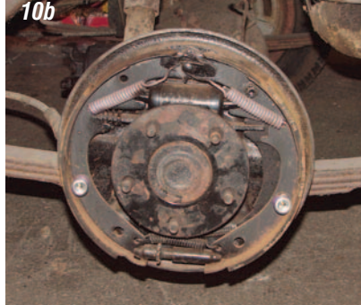
Photos 10a & 10b: Before installing the axle into the rear end, lubricate the O-

ring on the outside of the bearing with a light grease to help keep the O-ring from being damaged.