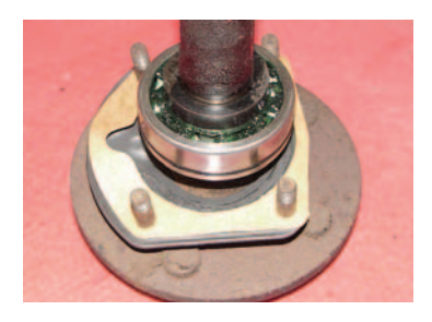
Photo 9: The gaskets used on the axle bearing cover keep any brake dust from getting to the axle bearing and damaging the bearing or seal. This seal does not retain rear end lube.