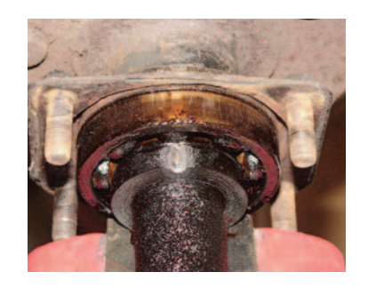
Photo 2: To remove the axle bearing, the retaining ring must be removed first. The retaining ring is made out of fairly soft material. Place the axle in a vice. Using a sharp chisel and hammer, split the retaining ring.

Photo 1: Remove the rear wheels, brake drums and loosen the four nuts that secure the axle retaining plate to the rear end. Using an axle puller, remove the axles from the rear end housing. The axle bearing is pressed onto the axle and is held in place with a pressed-on retaining ring.