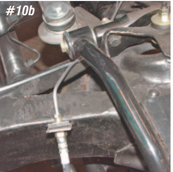
Photo #10a & 10b: A 3/16" X 50" brake line is supplied to connect the 3/16" tee to the right front wheel. The line can be routed across the front engine crossmember along with the other 3/16" line from the master cylinder.

With everything installed, turn the adjusting knob on the portioning valve all the way counterclockwise. This will open the valve all the way. Bleed the brakes and test drive the car carefully applying the brakes making sure the rear brakes do not lock up before the front brakes. If rear brake lock up occurs, some fine tuning of the valve is needed. Turning the adjusting knob clockwise will decrease the brake pressure to the rear brakes. Adjust the knob until you are satisfied that the front and rear brakes are operating evenly. If you wish, a pressure gauge P/N 49-200 can be used to check to check the brake pressure at the rear. In most cases less brake pressure is required at the rear of the car for good even braking. Good Luck!