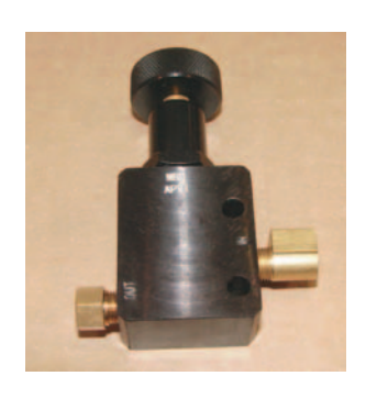
Photo #3: The adjustable proportioning valve P/N 20-87 has two ports; one marked "in" and one marked "out." The 90-degree fitting installs in the port marked "in" facing the adjusting knob. The straight fitting installs in the port marked "out".

used with power brakes or manual brakes. The proportioning valve bracket is held in place with the two master cylinder mounting studs.