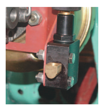
Photo #4: The proportioning valve is held to the valve bracket with two 1/4" X 1-1/4" bolts, nuts and lock washers P/N 34-400. Mount the valve with the adjusting knob facing upward and the inlet facing to the front of the master cylinder.