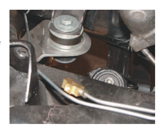
Photo #8: A 3/16" inverted flare tee is supplied to use as a junction block to feed the left and right front wheels. Install the tee on the end of the 24" brake line.