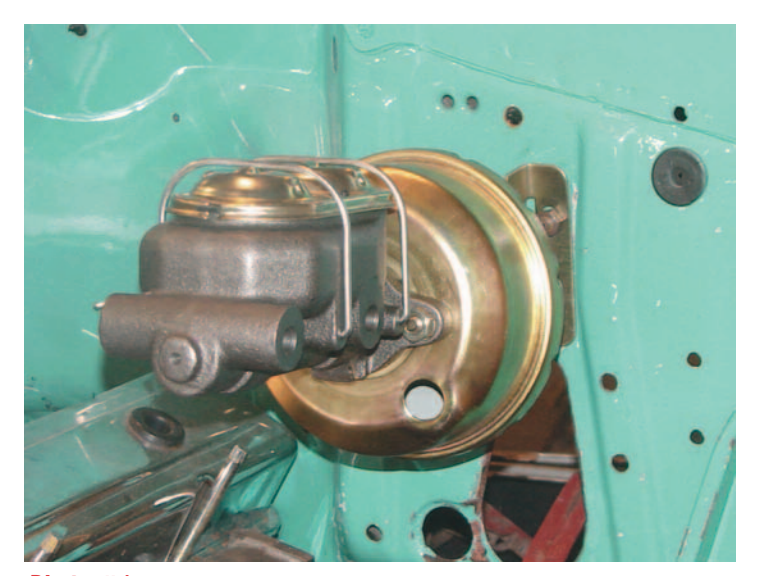
Photo #1: A dual master cylinder has two outlet ports. If an adjustable proportioning valve is going to be used, the front port of the master cylinder will be used for the front brakes and the rear port will be used for the rear brakes.

When a dual brake master cylinder is installed with disc or drum brakes. a proportioning valve must be installed. The brake bias (pressure) must be set properly so the car brakes evenly and stops safely. With a dual brake master cylinder and drum brakes or standard size disc brakes with 10" or 11" rotors, a GM-style five port proportioning valve like our P/N 20-32 works fine. If a disc brake kit is installed that uses large diameter rotors (12" or 13") the rear brake pressure may need to be reduced so that the rear brakes do not lock up before the front brakes. The only way to reduce brake pressure is to install an adjustable proportioning valve inline on the brake line that feeds the rear brakes. The adjustable valve is used by itself and not in conjunction with the GM-style valve. CCI offers a brake line kit P/N 20-138 that includes the correct fittings and lines to connect a dual brake master cylinder to an adjustable proportioning valve and from the valve to the rear brakes as well as the brake lines from the master cylinder to the left and right front brakes. A complete power booster/dual master cylinder/adjustable valve and line kit for use with disc or drum brakes is also available as P/N 20-135.