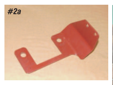
Photo #2a & 2b: The adjustable proportioning valve bracket P/N 20-35 can be