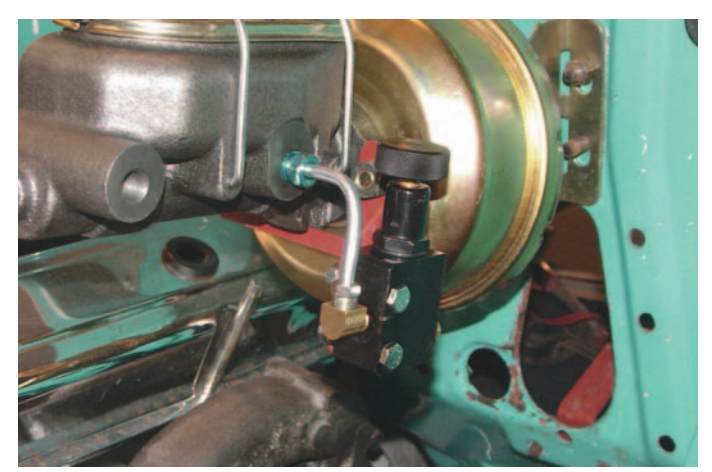
Photo #5: The brake line set P/N 20-138 includes a short 90-degree 1/4" brake line that connects the rear port of the master cylinder to the inlet side of the proportioning valve.