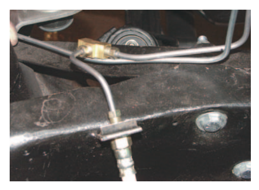
Photo #9: A 3/16" X 5" brake line is supplied to connect the 3/16" tee to the left front wheel.