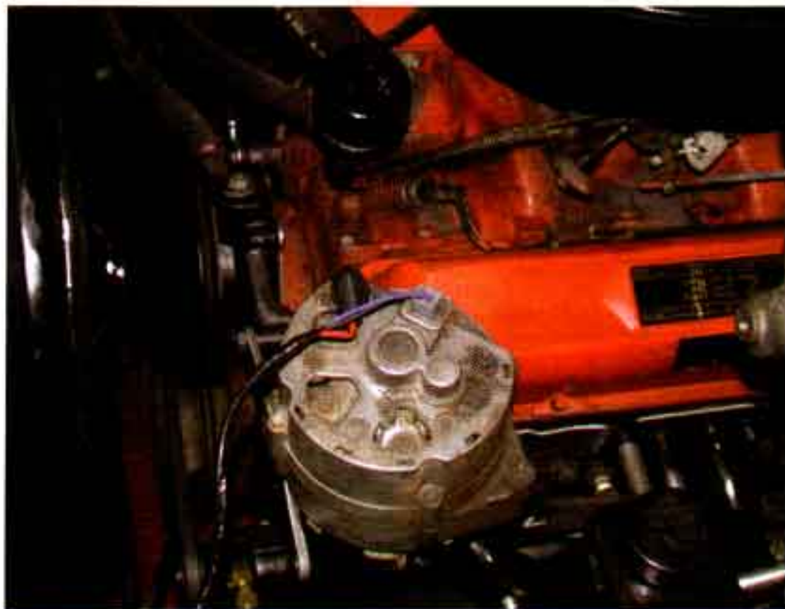
Photo #1: Disconnect the negative battery cable. Remove the original generator or alternator from the car. If you are converting from a

generator, purchase and install the proper alternator bracket.