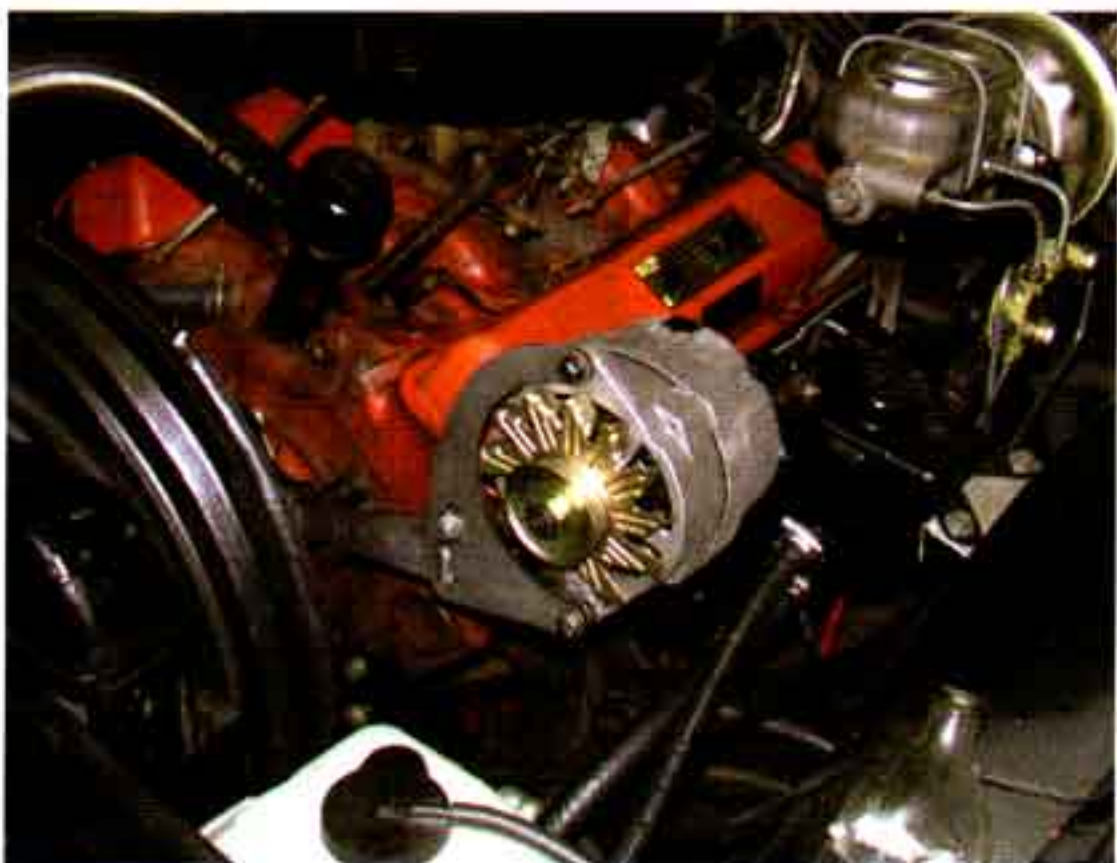
Photo #3: Install the alternator on the bracket, install the belt and adjust as

from the horn relay or directly from the battery. Attach this wire to the threaded stud on the rear of the new alternator.