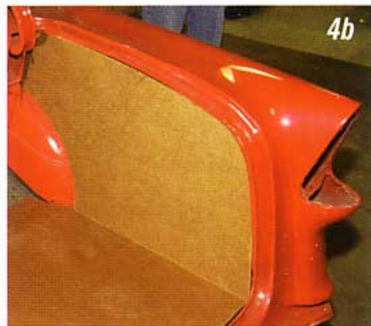
Photo #4a & 4b: The left and right trunk wall panels are trapped between the inner lip of the upper trunk wall and the trunk floor panel.

Photo #5a & 5b: Remove the small cover over the drivers side trunk hinge in order to install the forward trunk panel. The forward trunk panel is trapped between the inner lip of the trunk/rear window panel and the trunk floor panel. This will leave a 16" opening between the back seat and the forward trunk panel making it a perfect place to hide a CD player, the battery or a tool box and cleaning supplies.