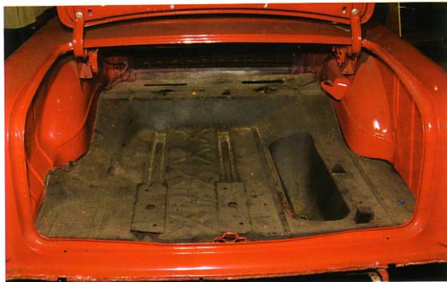
Photo #1: The trunk area on all sedans and hardtops is the same where the new panels are installed, so installation procedures are identical.