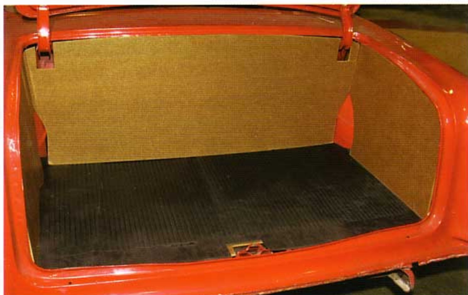
Photo #6: After installing the panels and checking for proper fit, remove them and upholster/cover them however you wish. Good Luck! ✓