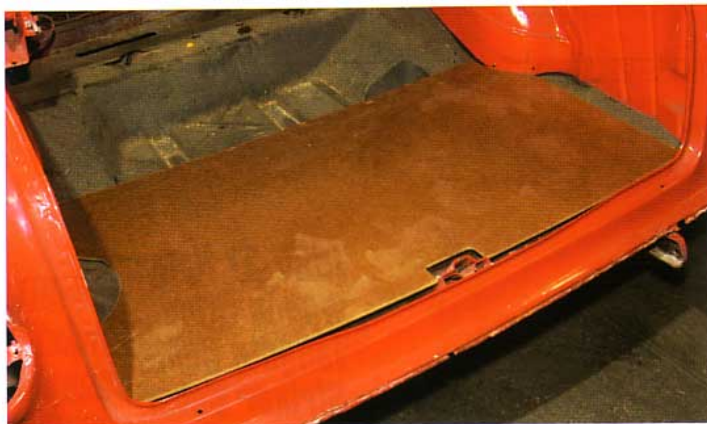
Photo #3: The trunk floor panel has a cut-out on the driver's side to mate to the bump in the trunk floor for the fuel filler tube. The panel is also cut out for the trunk lid striker plate and bracket. This panel will simply lay flat on the floor of the trunk.